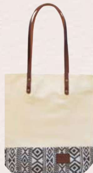
Black Aztec 070101