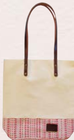
Red Aztec 070102